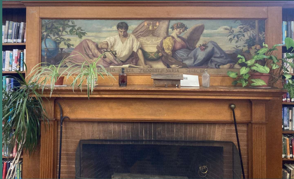
A few of the Windsor Public Library resident plants