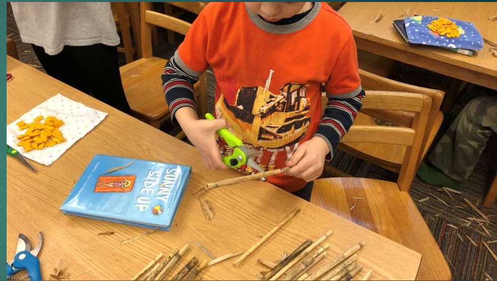
One children's program involves harvesting invasive fragmites and using these to create bees nests (where native bees can "hole up.")