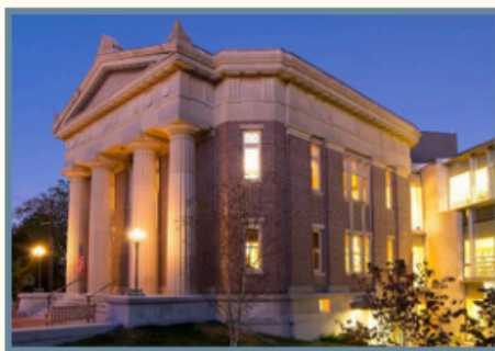
John Jermain Memorial Library Sag Harbor, New York

on becoming certified sustainable! We commend you for your commitment and achievement. Learn more with the links below!